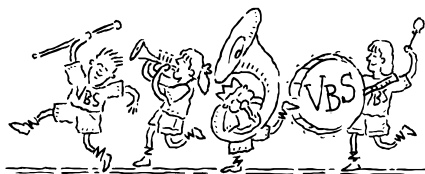
Vacation Bible School Celebration Sunday

It's almost time!! VBS will be held the week of July 10 – 14 from 9:00 to 12:00. Invite your friends and neighbors. We will have a picnic on VBS Celebration Sunday, July 16, immediately after worship. There will be games and activities for the children and adults can bring board games. Everyone is invited!